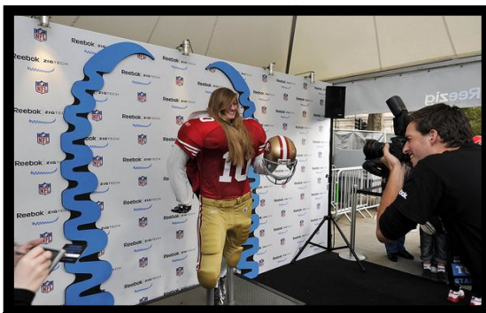
Reebok customized the fan photo display at the NFL International Series by inserting its ZigTech designs into the camera shot