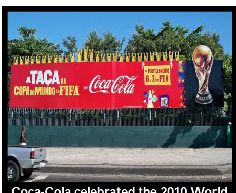
Coca-Cola celebrated the 2010 World Cup with billboard campaigns featuring fans doing the wave