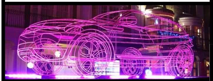
Check out Range Rover's terrific wireframe campaign here:

Range Rover teamed up with artists around the world to create wireframe installations of its award-winning Evoque vehicle that were featured in high traffic areas. The illuminated displays attracted thousands of eyeballs and created a truly memorable, artistic campaign.