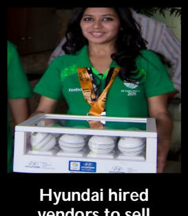
Hyundai hired vendors to sell commemorative items in the stands at the 2011 Cricket World Cup