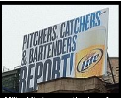
Miller Lite is generating buzz for the upcoming baseball season outside Wrigley Field with this creative billboard