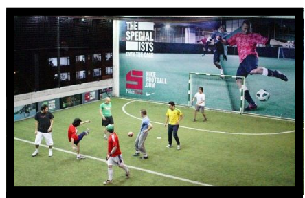
Nike emblazoned a soccer pitch in Bogota, Columbia with a massive soccer billboard for players to enjoy