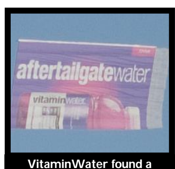
VitaminWater found a relevant way to message its product to sports fans attending live sporting events