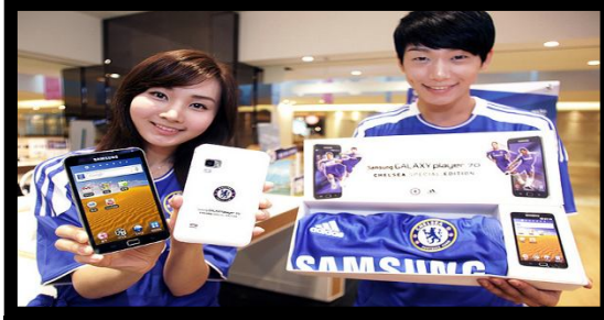
Chelsea FC and Samsung created a special edition Galaxy 70 product pack that came with a team jersey, branded case, and content