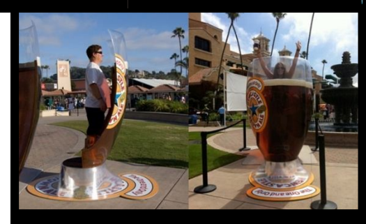
See It Here: http://bit.ly/oK0Yrl

by encouraging consumers to submit photos of their experience to its official Facebook page for the chance to receive exclusive swag. Fans were also encouraged to "check-in" at the footprint on Foursquare.