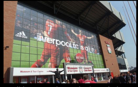
adidas created a marketing splash at Anfield, home of Liverpool FC, with a giant billboard outside the team store