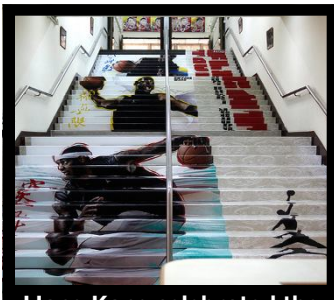
Hong Kong celebrated the arrival of the Brand Jordan Flight Tour with a creative branded stairway