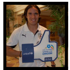
Unicef distributed giant thumbs up hands (resembling Facebook Likes) at Copa America