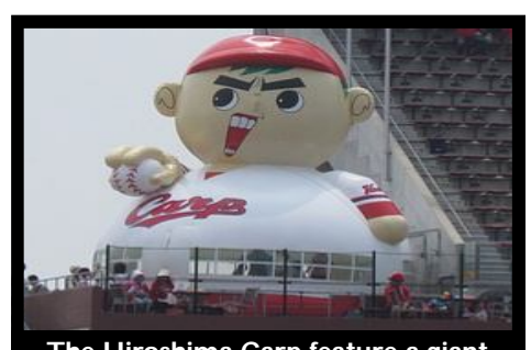
The Hiroshima Carp feature a giant baseball-themed bounce house for young fans to enjoy within their ballpark