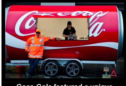
Coca-Cola featured a unique concessions display at the 2011 Rugby World Cup