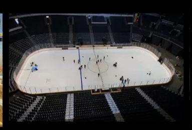
Arenas should capture their arena renovations: <a href="http://bit.ly/q1NhAF">http://bit.ly/q1NhAF</a>