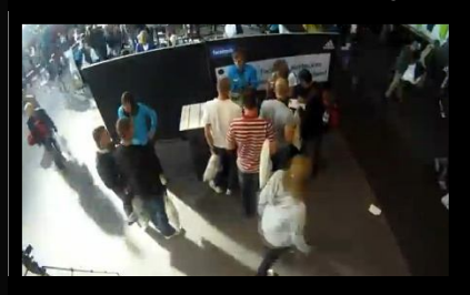
Brands should capture footprint traffic and engagement at events: http://bit.ly/o6BsI9