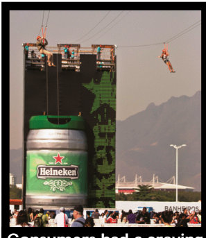
Consumers had a craving for Heineken while hang gliding at Rock In Rio