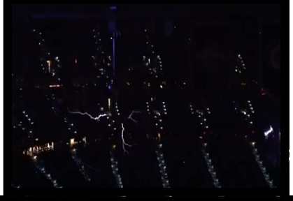
The TB Lightning created a real lightning effect in their arena