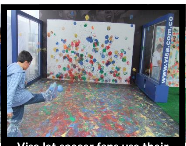
Visa let soccer fans use their skills and athleticism to create an original piece of art at Copa Mundial