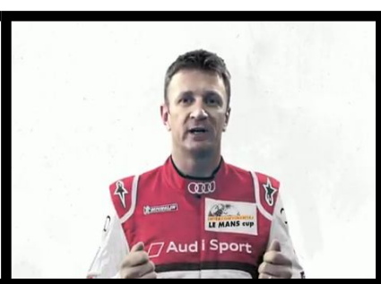
Audi Let Fans See What a Day in the Life of an Audi Le Mans Driver is Like