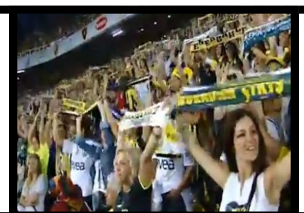
An Istanbul soccer club only allowed women and children to attend one of its recent games: http://bit.ly/mVaBzi